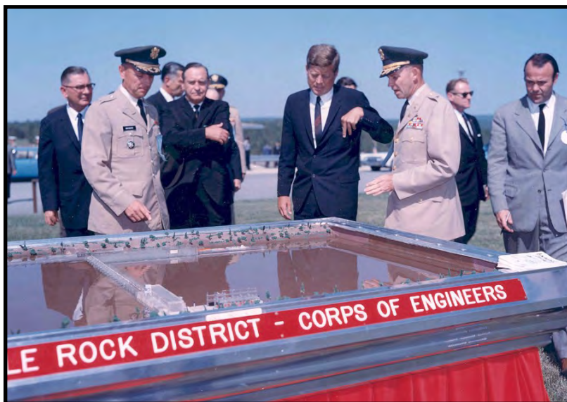
President John F. Kennedy dedicated the Greers Ferry Dam on October 3, 1963. This was one of his last major public appearances before his assassination in November of that same year.